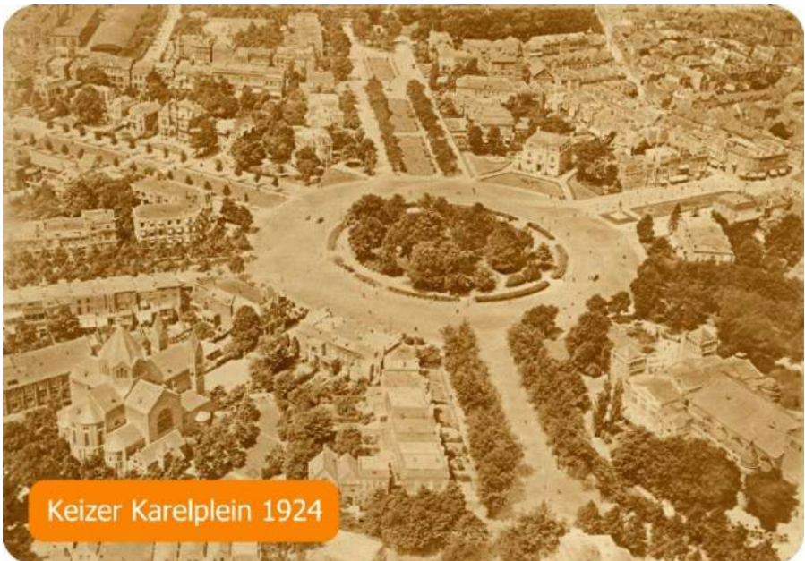
Keizer Karelplein 1924

At the founding of the Catholic University of Nijmegen in 1923, Titus Brandsma was appointed professor of philosophy and history of piety, especially Dutch mysticism. He would fulfil this calling until his death in 1942. Titus was convinced that the “flourishing of education is of the greatest significance for the flourishing of society”. He dedicated himself in so many ways to the formation and learning of young people. From 1924 to 1931, the university’s main auditorium was established in a large town house on the Keizer Karelplein 33. During his professorship the large rooms within the town house Van Schaeck Mathonsingel 4 were also used by Titus and his colleagues for giving philosophy lectures.